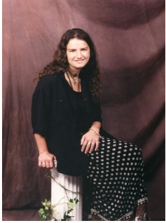
Standard studio photograph.

It is the end of an era and the beginning of a whole new world. Your senior year of high school is a time for preparation and a time for remembering. How do you want to be remembered? Senior portraits, like yearbooks and team pictures, make their way