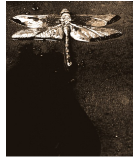
The Dragonfly (Sepia)