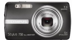
Olympus Stylus 750

There are many great pocket cameras out there. I just have experience with this one. I like the idea of a pocket camera because it can go everywhere with you. You don't have to have a separate bag or a purse, it just slips in a pocket and away you go. You never have to say you missed a shot because you couldn't carry around your camera. Of course, this doesn't mean you won't miss a great shot or two. I walked out of the house the other day, saw a great photographic opportunity, pulled my Stylus out and then remembered the battery was charging on my desk at home. I hate it when that happens.