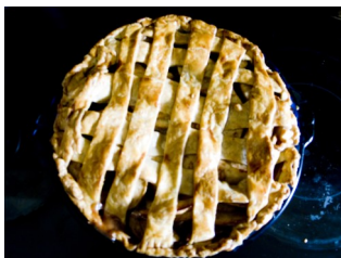
Actual photo of the apple pie I made for our family Independence Day celebration.!