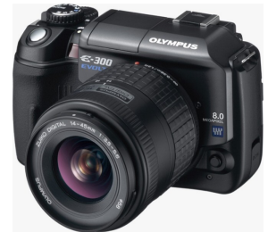
A stock picture of my Olympus Evolt 300

http://www.bbc.co.uk/photography/genius/ .