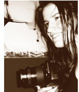
New picture now located on the biography page.

I decided I needed a better picture for my biography page on the website and who better to do that than myself. So I began imagining I was at a networking event and trying to make a good impression. Through this experiment I believe I will be better able to find the true face of the people who, like me, are uncomfortable in front of the lens.