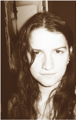
Best picture out of the bunch.

I have never been able to take a good picture of myself. I don't like to smile because it always looks fake and, though I am very comfortable behind the camera, I lack that sense of peace when on the other side. I never feel that I look good in other people's pictures either. As a photographer, I have had to calm the fears of many people who say, "I never take good pictures." For most people, this has nothing to do with an innate unattractiveness but rather insecurities and the tendency to frown or contort the face when put in front of a camera. A friend told me once that I looked like I was going to kill the camera man.