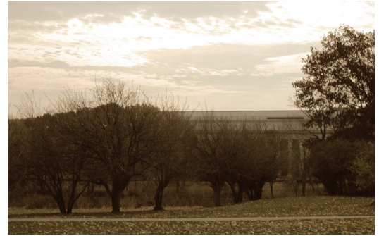
Museum of Fine Arts in Boston through the Fens

To backtrack, in 2001, two friends drove me from Tacoma, Washington to Boston, Massachusetts for college. On the way, we passed through Yellowstone National Park and Washington DC. I was using my Olympus 3030z fixed lens camera at the time, but still managed to capture some interesting images of the late summer and fall of 2001. See all of the pictures here .