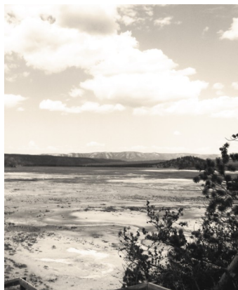
Sulfur Pits in Yellow Stone National Park

Recently I got back in touch with a friend from my days on the east coast. She mentioned that she hadn't seen many of the pictures I took while I was in Boston on the website. She was right, there was a large file of photographs getting "dusty" in my computer, so I decided to go through these pictures and find the hidden jewels.