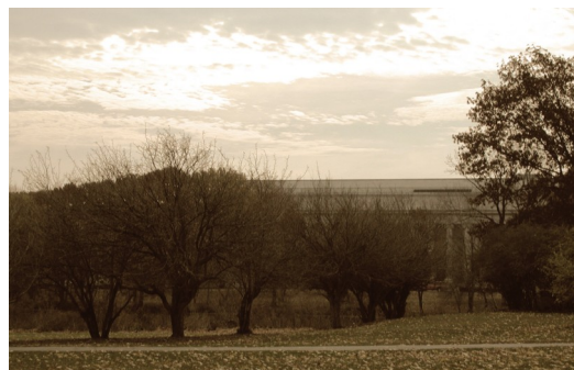
Museum of Fine Arts in Boston through the Fens

To backtrack, in 2001, two friends drove me from Tacoma, Washington to Boston, Massachusetts for college. On the way, we passed through Yellowstone National Park and Washington DC. I was using my Olympus 3030z fixed lens camera at the time, but still managed to capture some interesting images of the late summer and fall of 2001. See all of the pictures here .