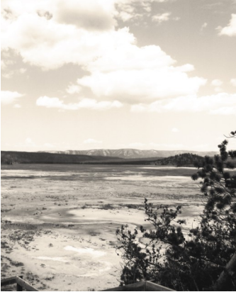
Sulfur Pits in Yellow Stone National Park

Recently I got back in touch with a friend from my days on the east coast. She mentioned that she hadn't seen many of the pictures I took while I was in Boston on the website. She was right, there was a large file of photographs getting "dusty" in my computer, so I decided to go through these pictures and find the hidden jewels.