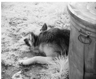
"Sorry Pooch, no scraps tonight."