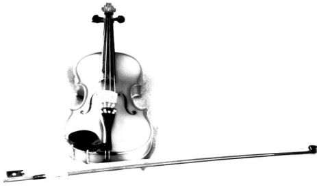
The Stark Violin

I love taking the almost mundane objects in life and showing their spectacular side. One of the first pictures I took that showcases this idea is The Violin. It is not the most beautiful violin. It is not old or filled with character, but it was mine, and at the time of this picture, I had been playing it for seven years. It was meaningful to me, and in turn has become an important picture to other people.