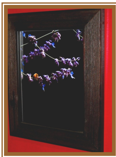
Bee on Russian Sage