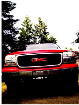
Red Pick Up

I love taking the almost mundane objects in life and showing their spectacular side. One of the first pictures I took that showcases this idea is The Violin. It is not the most beautiful violin. It is not old or filled with character, but it was mine, and at the time of this picture, I had been playing it for seven years. It was meaningful to me, and in turn has become an important picture to other people.