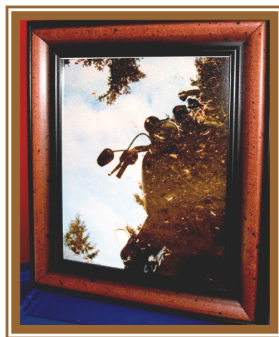
Puddle Bike Framed

As the gift buying season approaches, the world is accosted by fast talking salesman and crowded malls. There is a draw to the quiet comfort of the internet, but a fear that the items requested will not be shipped in time sends people back to the crowded streets. There is a desire to move away from the mass producible products, and into unique pieces.