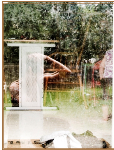
Capturing the Photographer 2

The Etsy shop has expanded with the edition of Photo Cards and a larger selection of unframed prints. I am still working on a new photography book for Blurb that I hope to get out by the end of the month. A "New Art" page will be going up this month featuring the