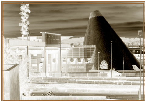
"Glass Museum Inverted Sepia"