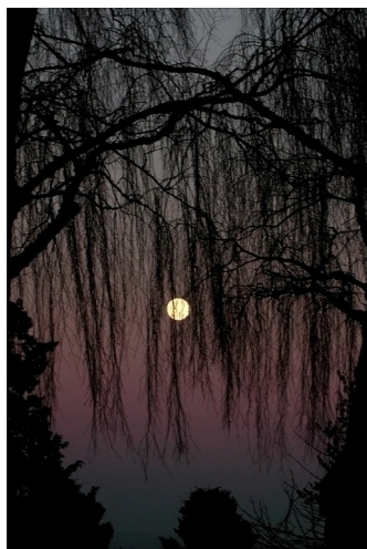
"Moon through Trees"

In these dark days, don't forget to rejoice in the sun and the moon and the stars that are often visible behind or between the grey clouds that cover our winter skies. Low light, night shots will come out better if you use a tripod and a longer exposure, especially if you are shooting the stars. With the sun, make sure you do not point your camera directly at the sun, the camera is really just a whole bunch of mirrors, damage may occur. Looking for something a little different, adjust your aperture to the highest setting (smallest size) and use a relatively short shutter.