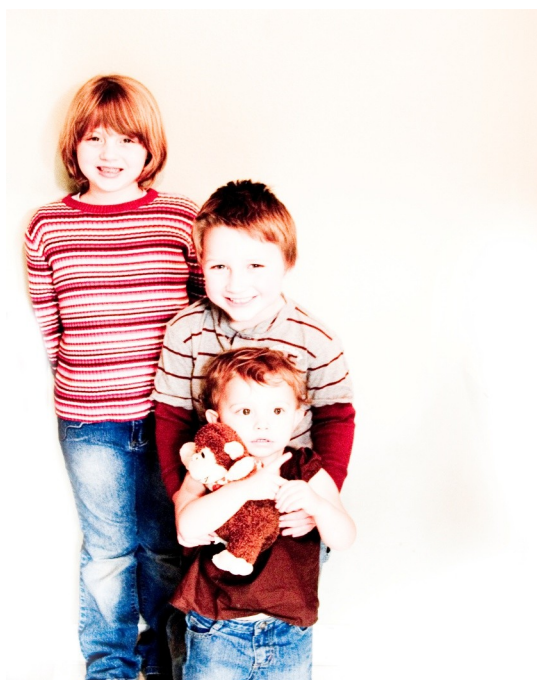
"The McTernen Kids"