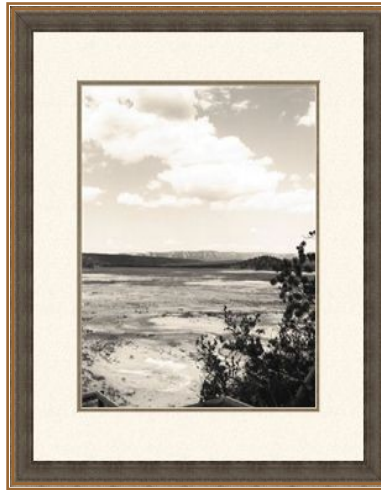
"Sulfur Pits" framed through Imagekind.com

Please stop by my shop and let me know what you think.