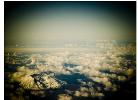
"Mt. St. Helen's"

I am happy to report, 2008 was a good year for Ardent Photography, both with business and with new work. One of the issues with being so busy though, is that new photographs are delayed in being published. On that note, I would like to invite you all to please check back frequently during the next month as there will be plenty of new photographs for you to enjoy including a series of musical instruments, pictures from our snowy December, and past and present pictures taken from the dirty windows of commercial airplanes.