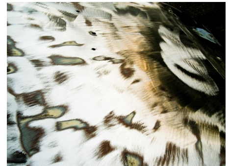
“Sanding Patterns ”

the sander he created patterns and ventured closer to the base metal of the body panels, where unique designs emerged from the grain of the sand paper, the sheen of the steel and the multitude of colors from eleven layers of Ford paint.