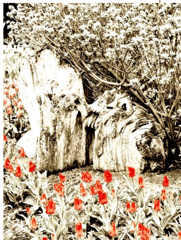
“A Haunted Garden”

I am not a very big photographer of flowers. I catch one or two that I think are particularly interesting, but for the most part, flowers themselves are not my subjects of choice. Recently, I was sorting through old photographs (again) and I came across some I had taken at the Skagit Valley Tulip Festival in Mt. Vernon, Washington. The photographs were nothing special, which is why they had not been touched until now. The problem is I have this concept in my head, that I took these photographs for a reason and I shouldn't just let them sit there, digitally degrading. So as I opened myself up to the creativity of the shot, disregarding the image quality issues from my old camera, I came away with a dynamically different view of the flowers that were once only tulips.