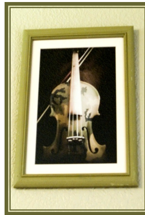
The Camo Violin

Typically, photographs are matted and framed in black wood as seen on many a gallery wall, but I believe the frame is the finishing touch that deserves just as much consideration as the elements of the photograph itself. The type of wood, the construction, the embellishments, whether or not to use matte: these all create a piece of art beyond the photograph. When I frame, I want to create a piece that will look wonderful in a living room, dining room or even a bathroom. I am not designing for the stark museum landscape. I am designing for the warmth of a home.